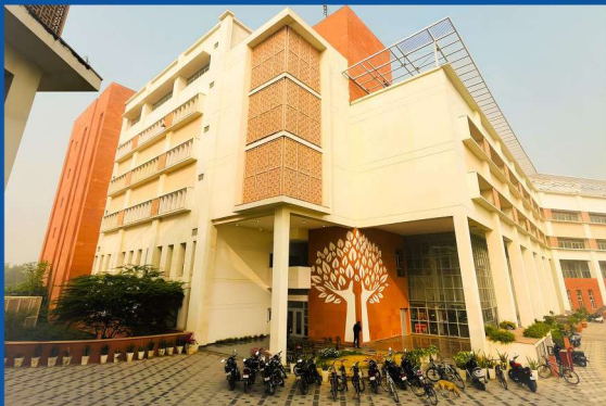
Faculty of Social Sciences