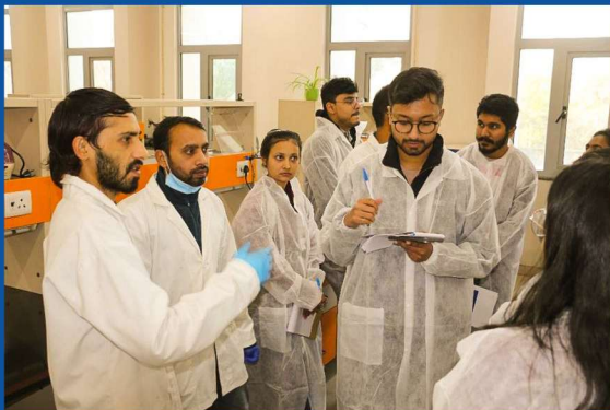
Faculty of Life Sciences and Biotechnology