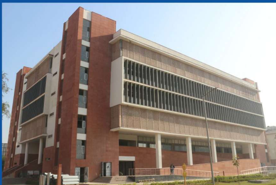
Faculty of Engineering and Technology