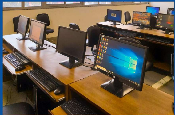
Faculty of Mathematical Sciences