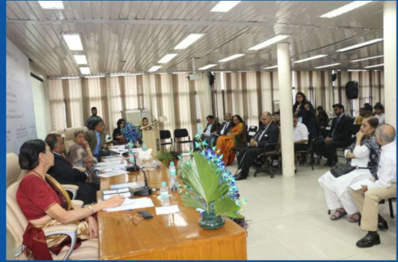
Faculty of Legal Studies