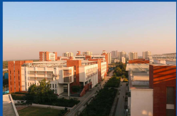
SAU Virtual Campus