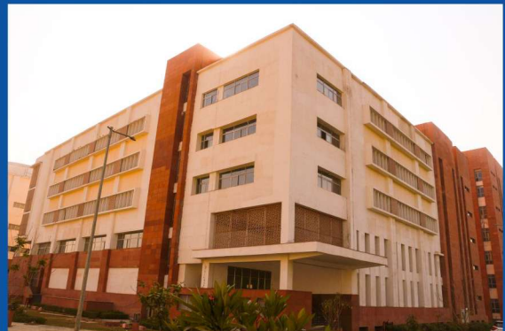
Faculty of Arts and Design