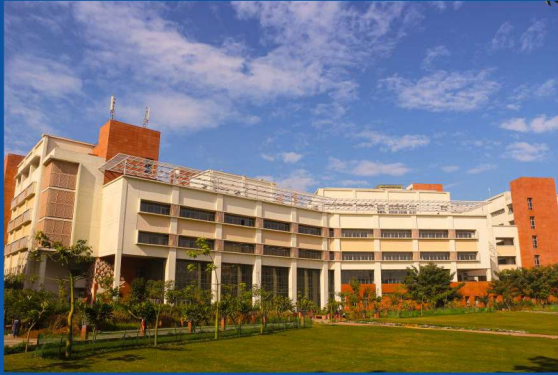
Faculty of Economics