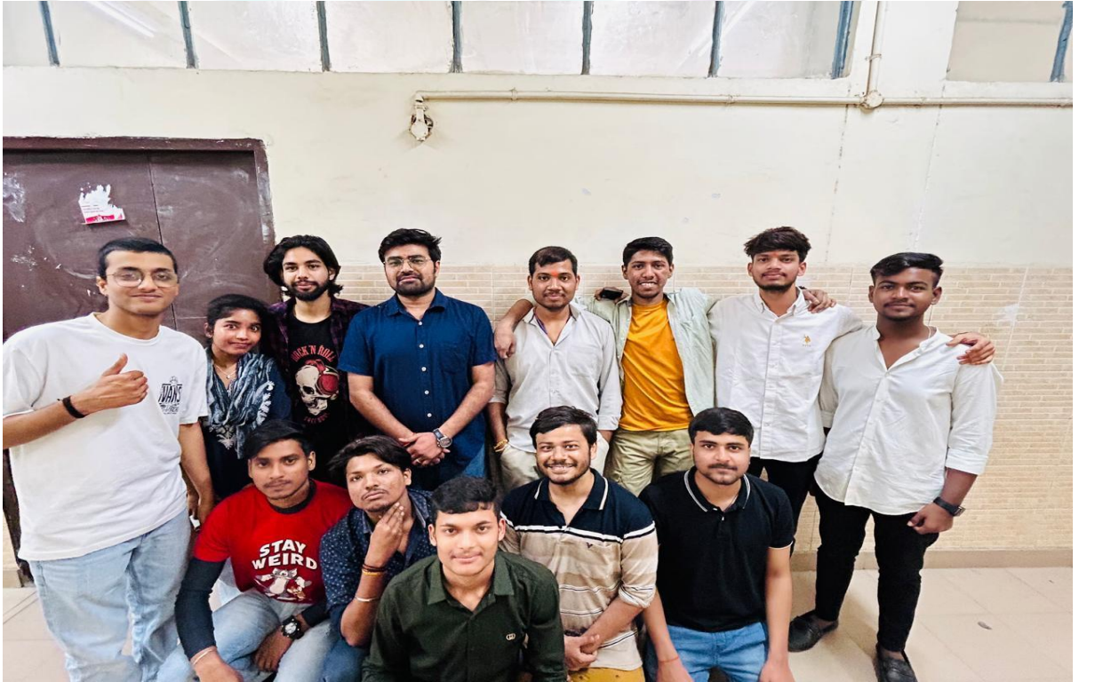
Department of Sanskrit, Motilal Nehru College (Evening), DU