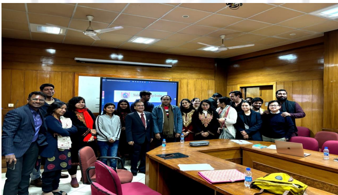
Department of English, Motilal Nehru College (Evening), DU