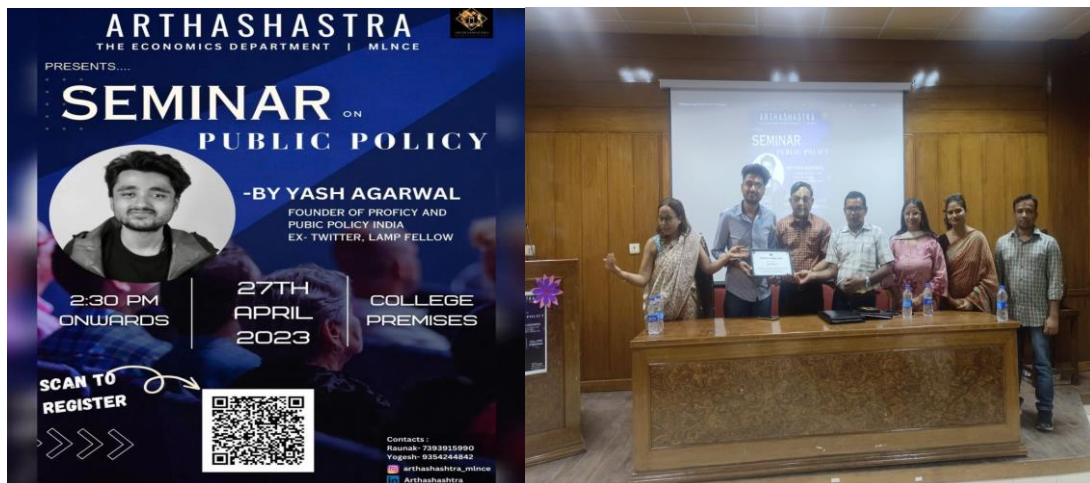
Seminar on Public Policy, 27 th April, 2023, organised by Arthashashtra, Department of Economics, MLNCE