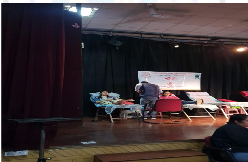
Blood Donation Camp with NESSDU and AIIMS, 19 th February 2024 North-East Cell, MLNCE