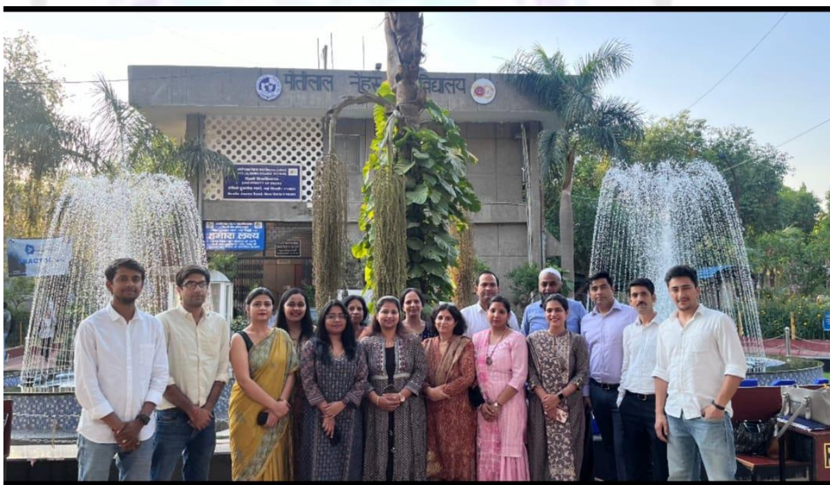
Department of Commerce, Motilal Nehru College (Evening), DU