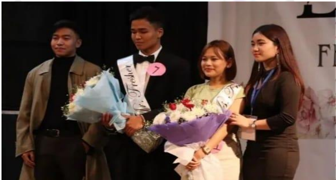
Interactive Session Cum Freshers' Meet, 4th November, 2023, North-East Cell, MLNCE