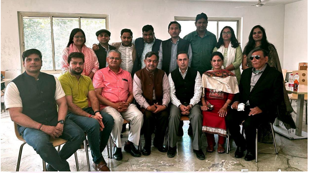
Department of Hindi, Motilal Nehru College (Evening), DU