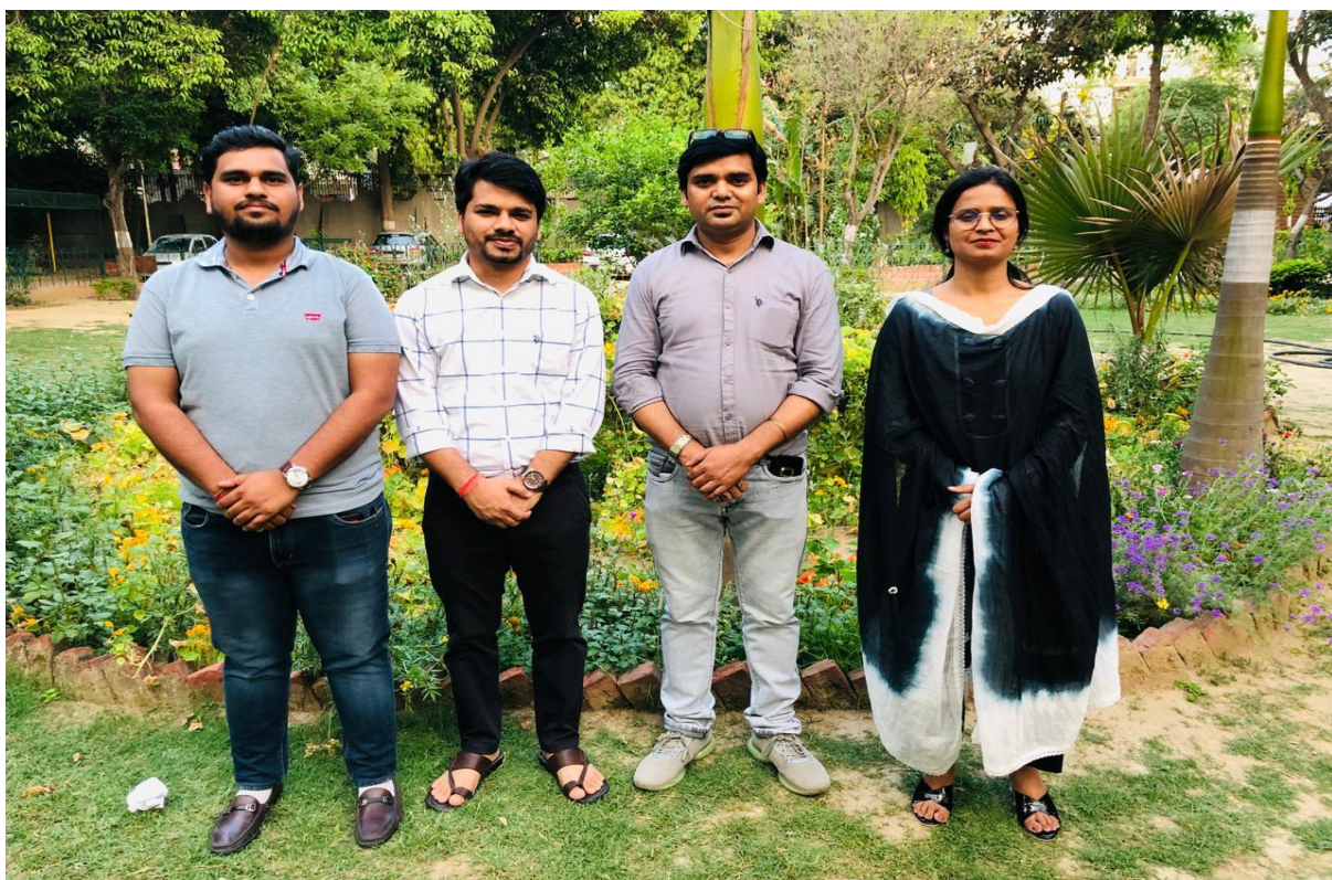
Department of Mathematics, Motilal Nehru College (Evening), DU