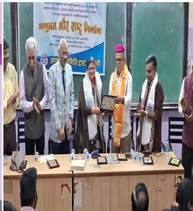
Anuvrat and Nation-building, Department of Political Science, MLNCE and Anuvrat Samiti Trust, Delhi, 15 th March 2024