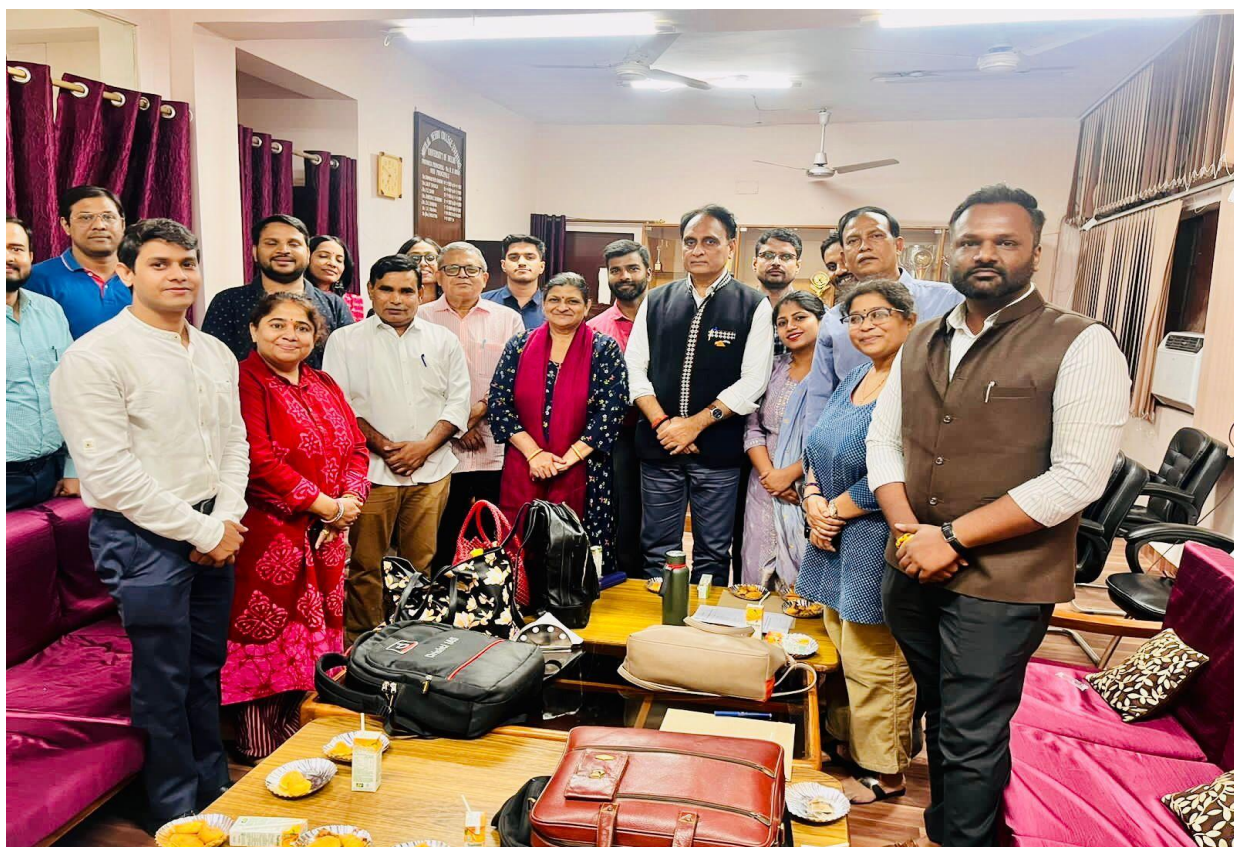
Department of Political Science, Motilal Nehru College (Evening), DU