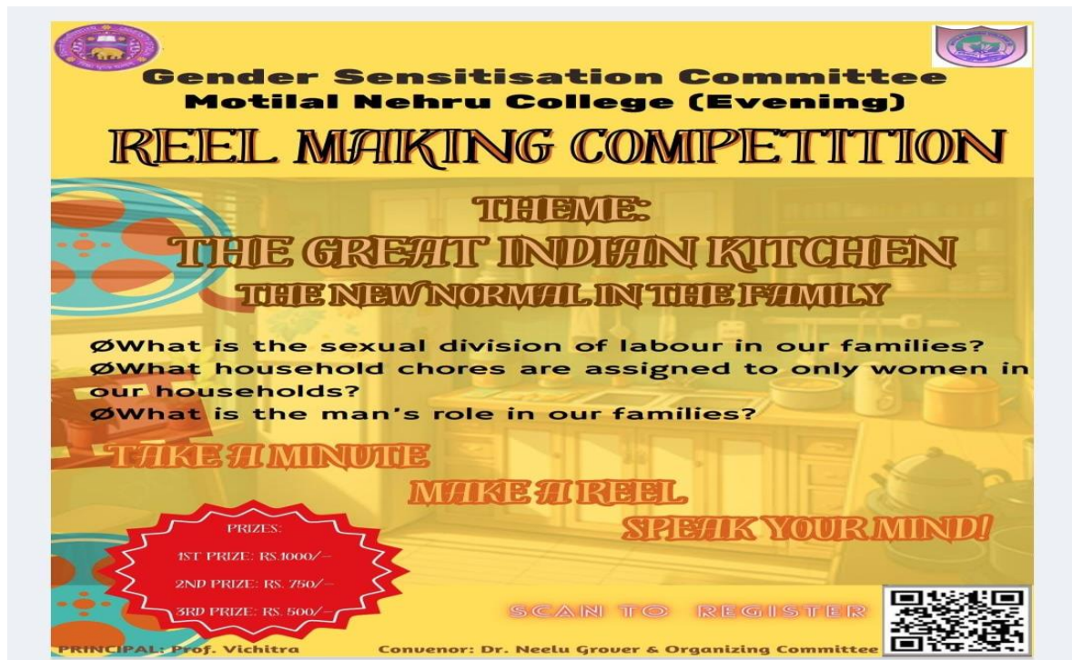
Reel Making Competition, Gender Sensitisation Committee, MLNCE, 8 th -12 th March, 2024