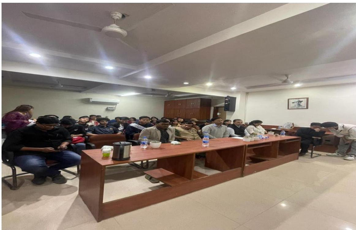
Donation Drive for Manipur and Sikkim, NE States on 9 th November 2023, North-East Cell, MLNCE